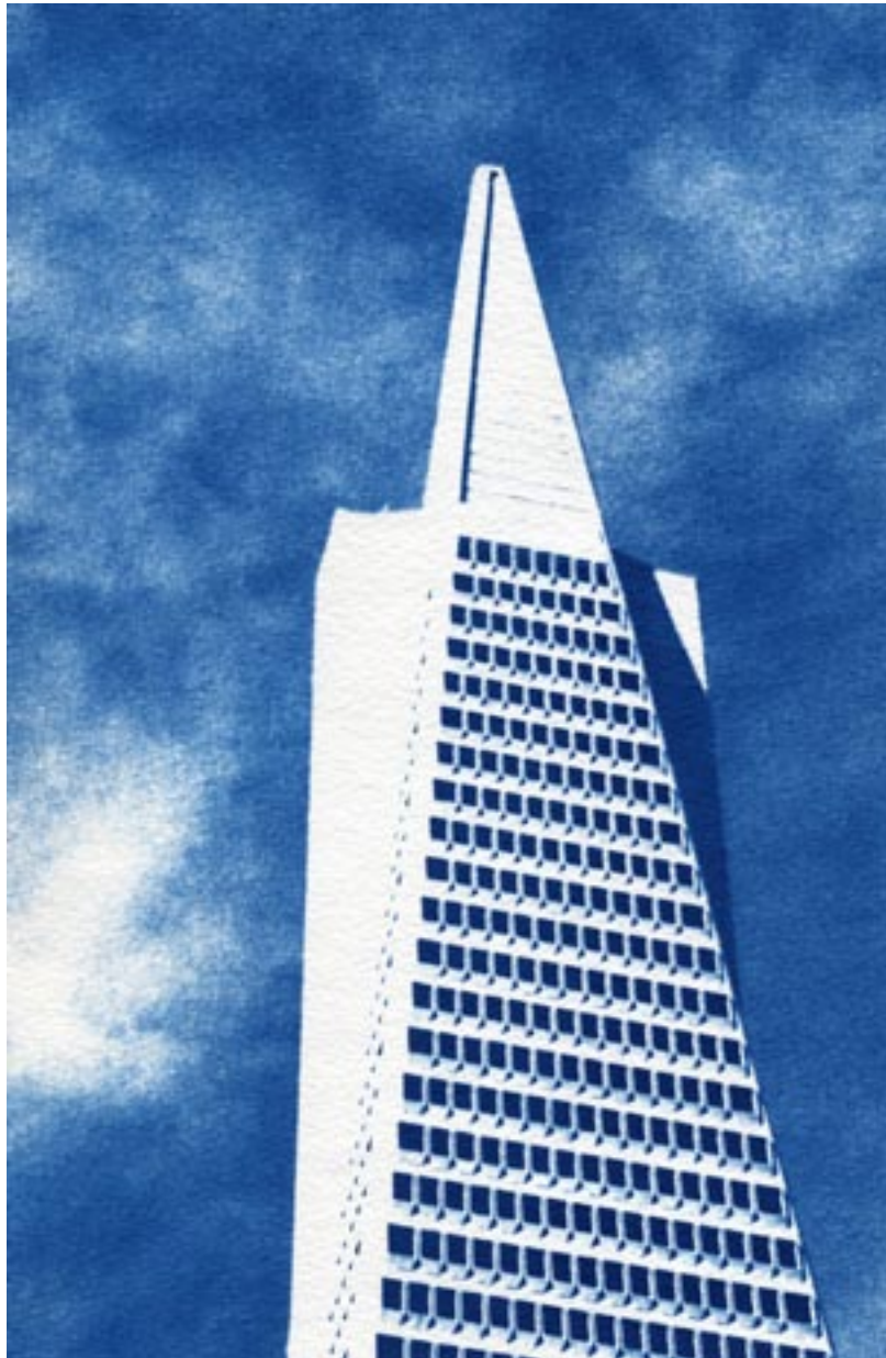
MODERN PHARAOH: CYANOTYPE

results. There is something in all of the pigmented alternative processes that flatter skies and make modern designs seem especially monumental. I enjoy representing modern objects with antique methods. Alternative processes give me the flexibility to express the way I feel about the subjects that is vivid, enjoyable, and tactile.”